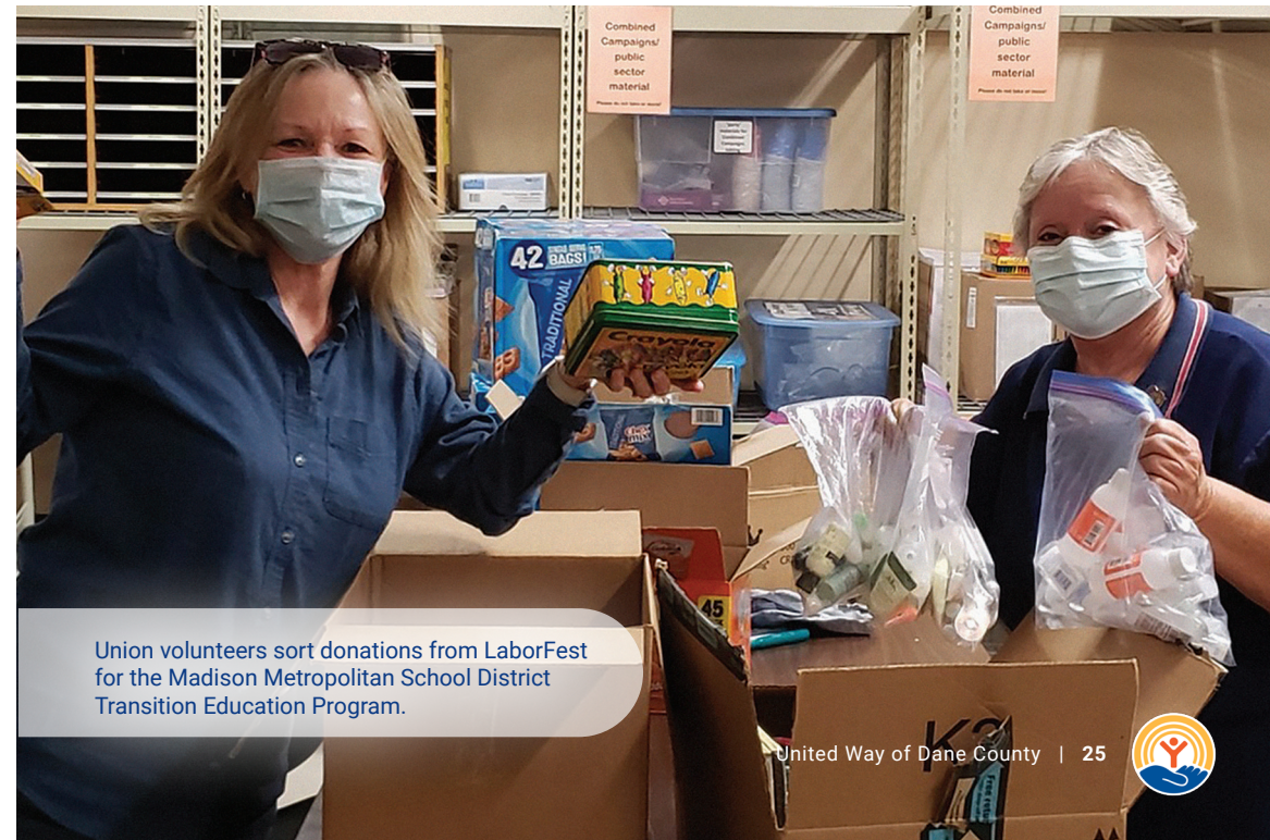
Union volunteers sort donations from LaborFest for the Madison Metropolitan School District Transition Education Program.

AFL-CIO Community Services Program. United Way of Dane County and the South Central Federation of Labor, AFL-CIO have mutually benefited from our more than 60-year partnership. Providing worker voice through Labor representation on every United Way volunteer committee, supporting dislocated workers with resources, hosting drives/collections and enhancing income strategies for the Plan for Community Well-Being are just a few ways Labor, through United Way, makes our community a place where all can thrive.