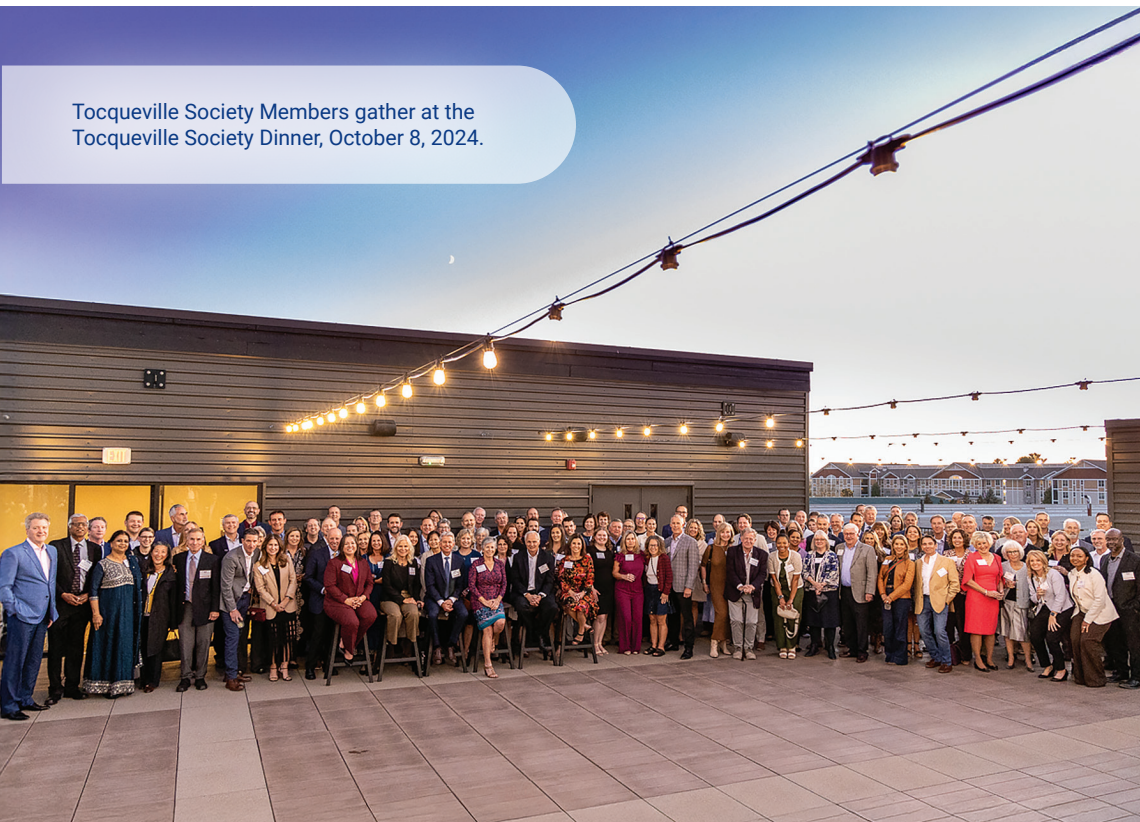
Tocqueville Society Members gather at the Tocqueville Society Dinner, October 8, 2024.